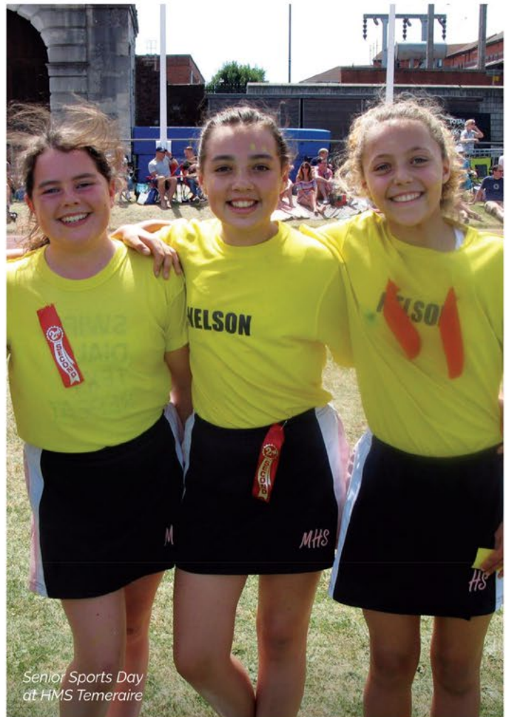
Senior Sports Day at HMS Temeraire