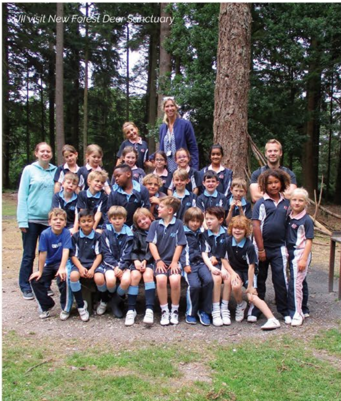
MIII visit New Forest Deer Sanctuary