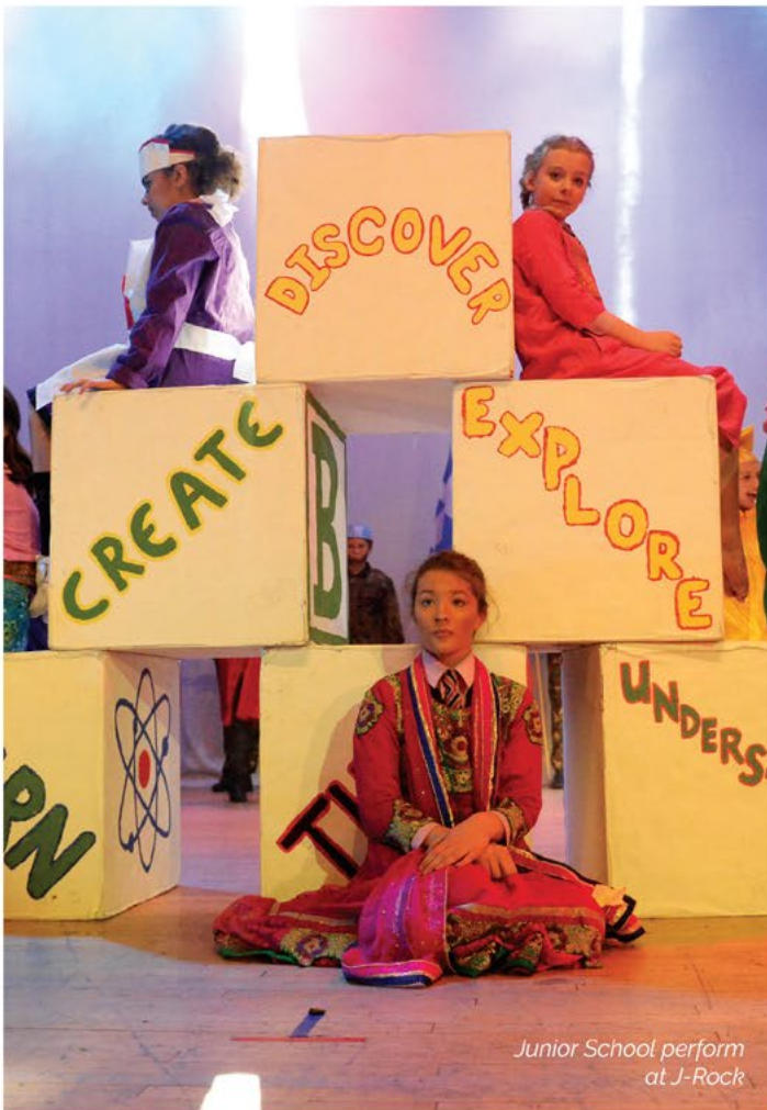
Junior School perform at J-Rock

All Mayville pupils are encouraged to exercise their creative imagination and develop self confidence whilst working as part of a team, whether on stage or behind the scenes.