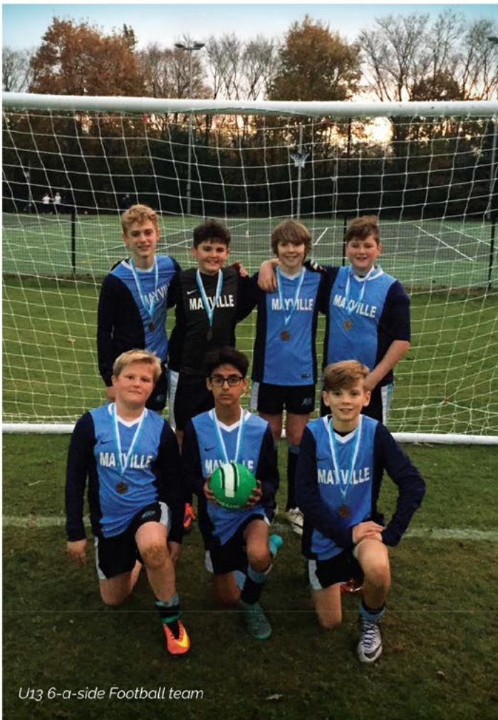
U13 6-a-side Football team

Pupils from L3-U3 took part in the Portsmouth Schools Rounders Festival at Cockleshell Gardens. A fantastic display of teamwork resulted in Mayville A as Gold medal winners in their pool and Mayville B claiming the silver medal in theirs.