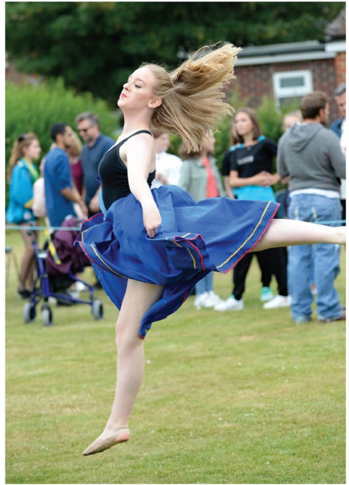
Dance performance at the Anniversary Garden Party.