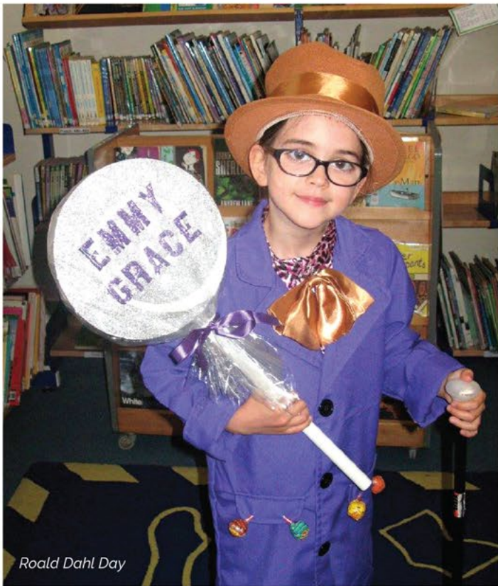
Roald Dahl Day