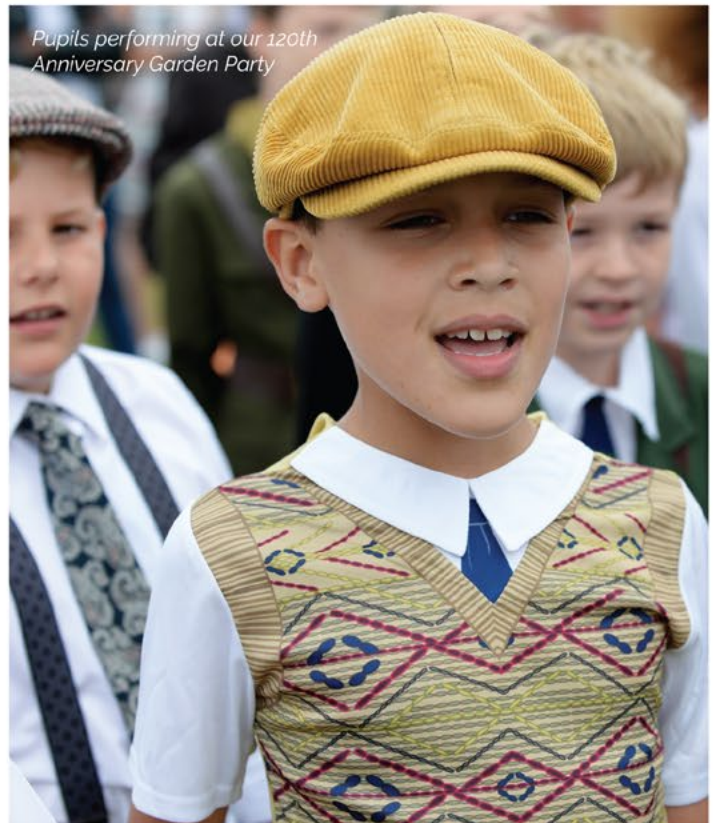
Pupils performing at our 120th Anniversary Garden Party