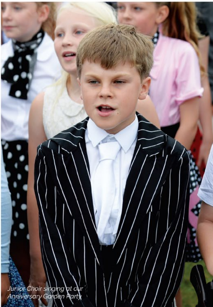
Junior Choir singing at our Anniversary Garden Party