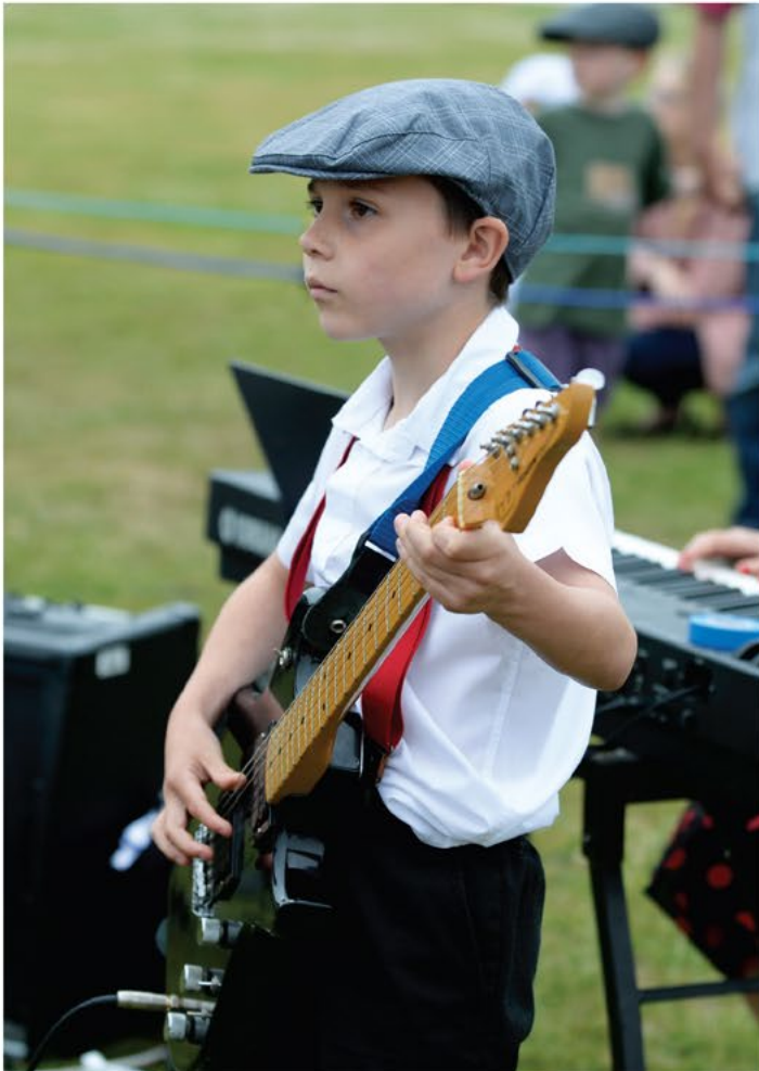
Band performing at the Anniversary Garden Party