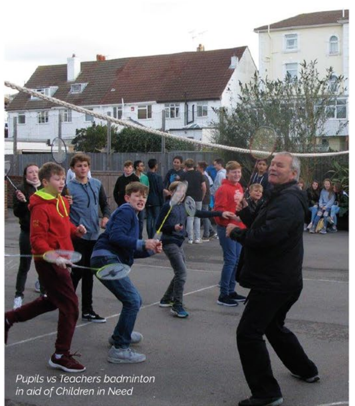
Pupils vs Teachers badminton in aid of Children in Need