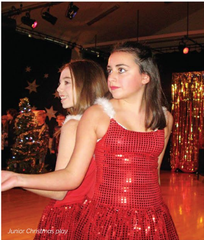
Junior Christmas play