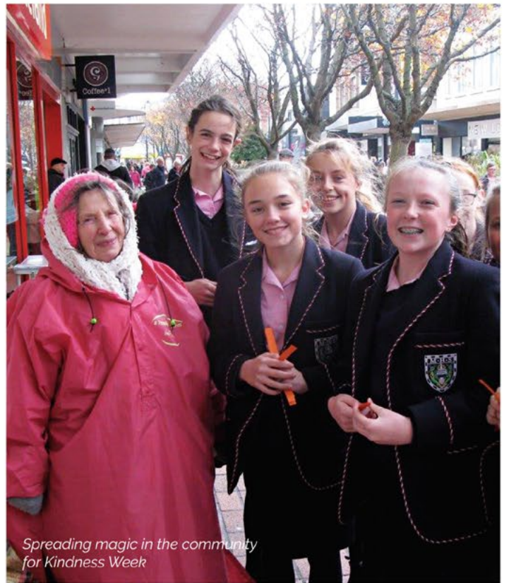
Spreading magic in the community for Kindness Week