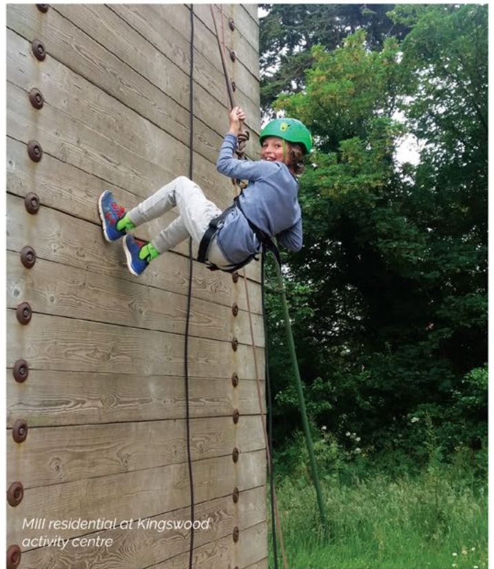
MIII residential at Kingswood activity centre