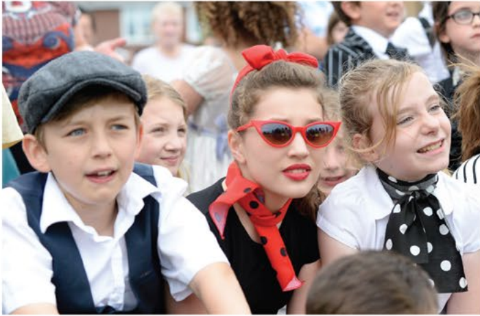
Pupils wearing period costumes