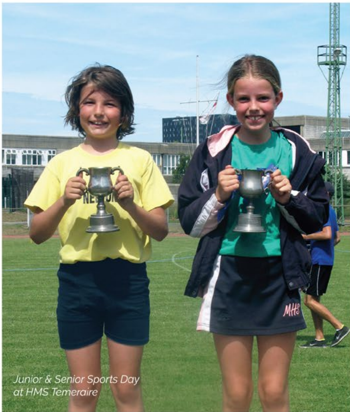
Junior & Senior Sports Day at HMS Temeraire