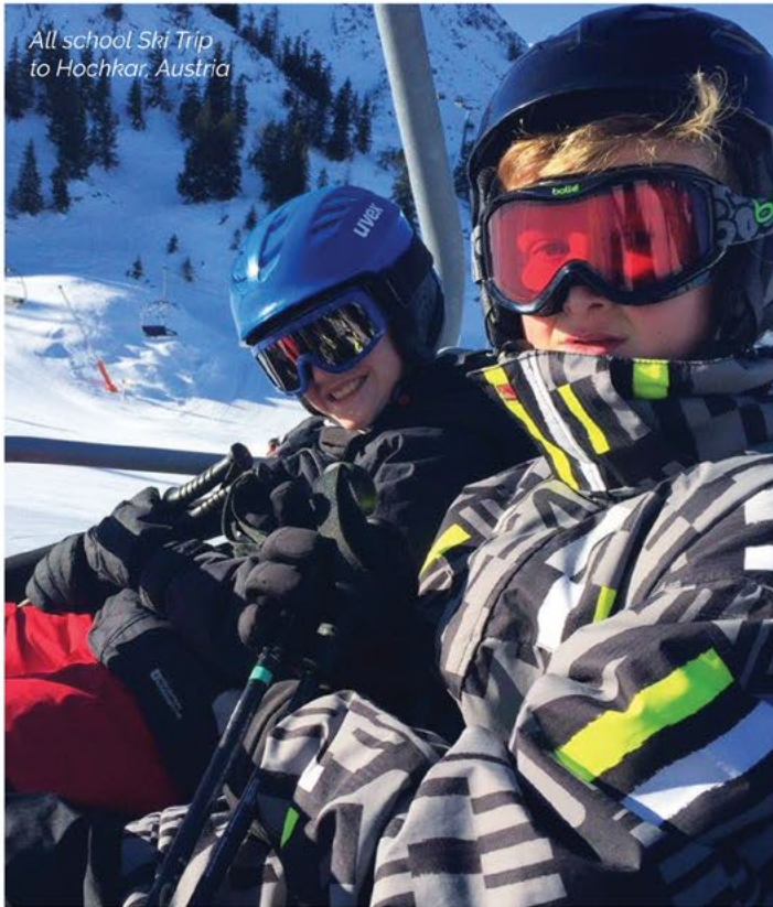
All school Ski Trip to Hochkar, Austria