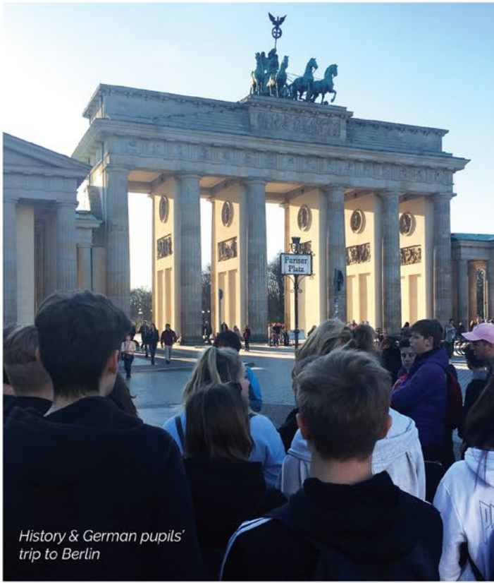
History & German pupils' trip to Berlin