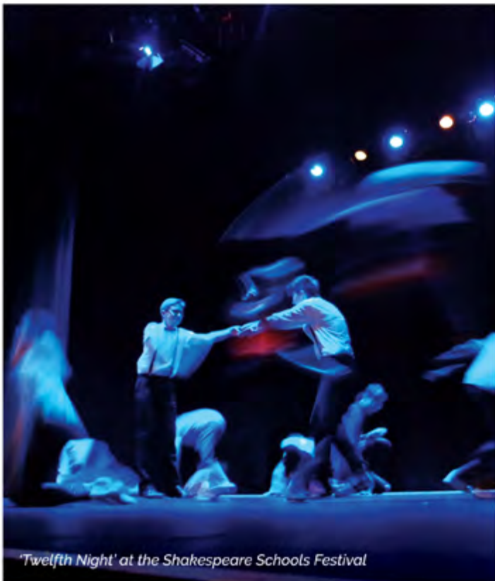
'Twelfth Night' at the Shakespeare Schools Festival