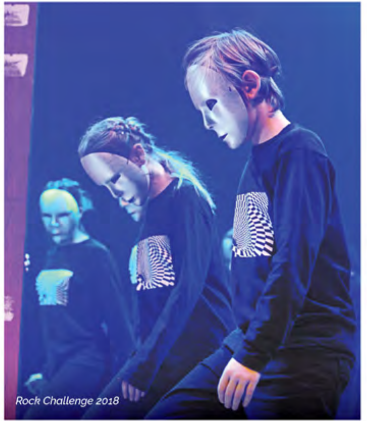
Rock Challenge 2018