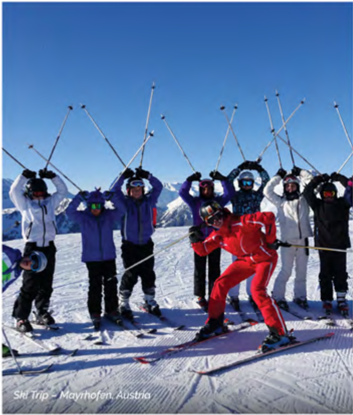
Ski Trip - Mayrhofen, Austria