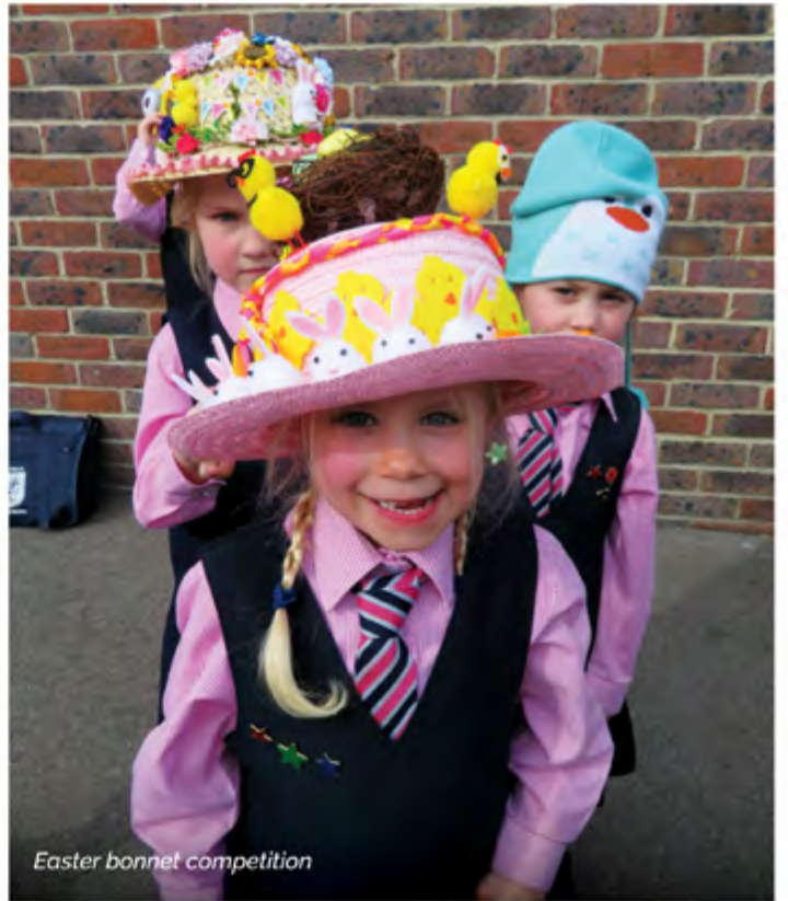
Easter bonnet competition