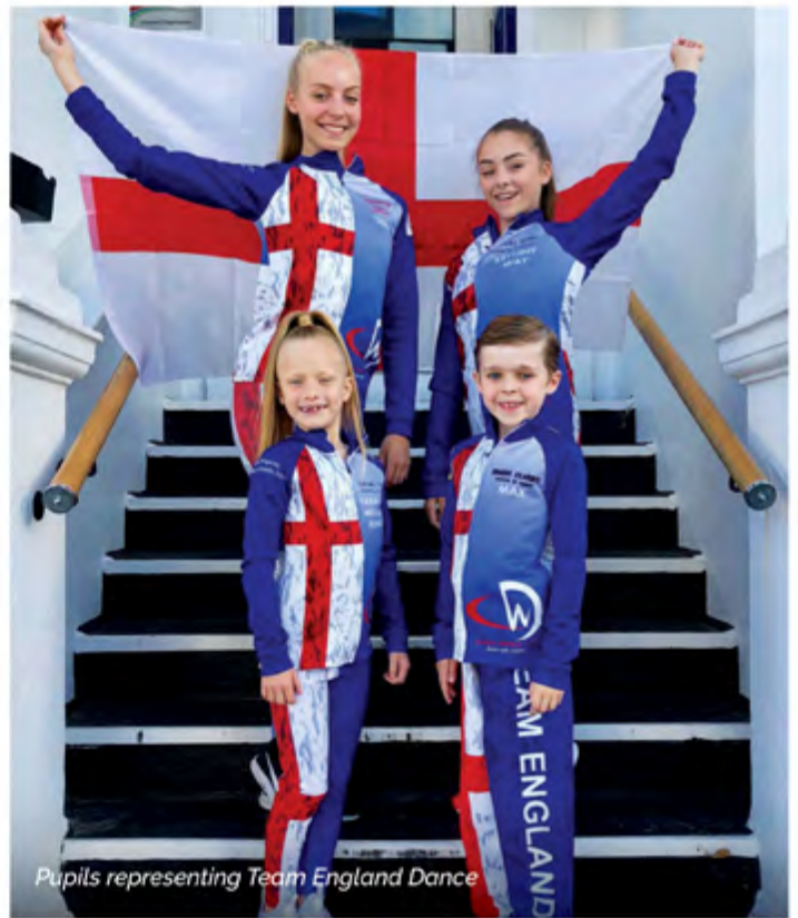
Pupils representing Team England Dance