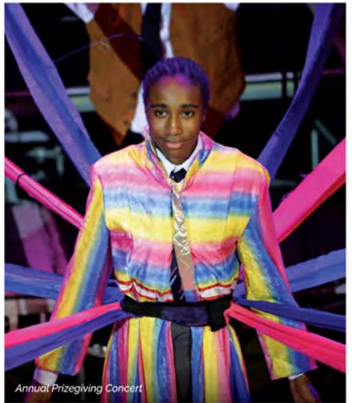
Annual Prizegiving Concert