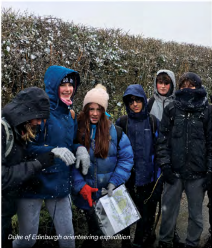
Duke of Edinburgh orienteering expedition