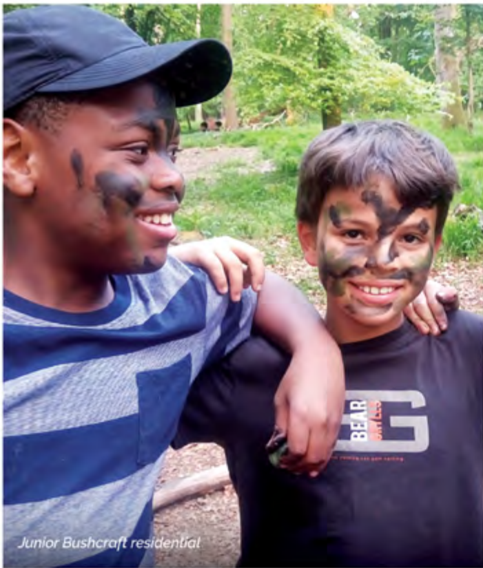
Junior Bushcraft residential