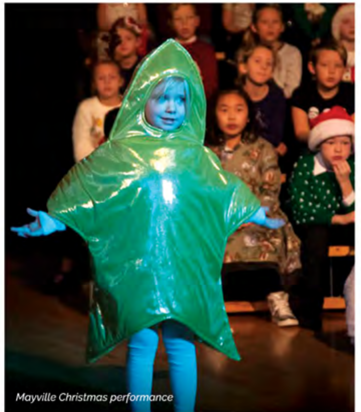
Mayville Christmas performance