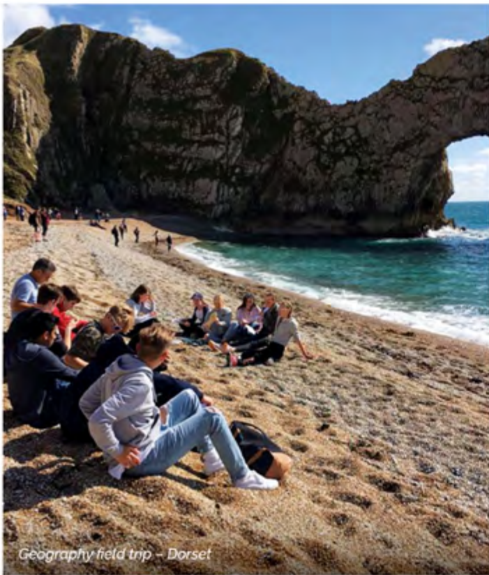
Geography field trip – Dorset