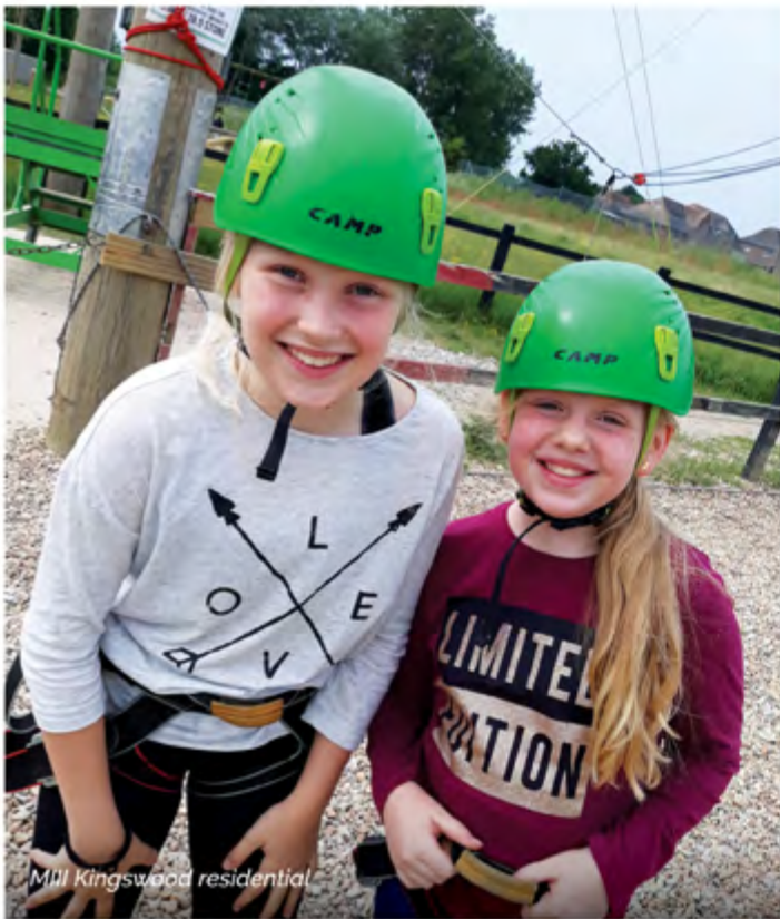
Mill Kingswood residential