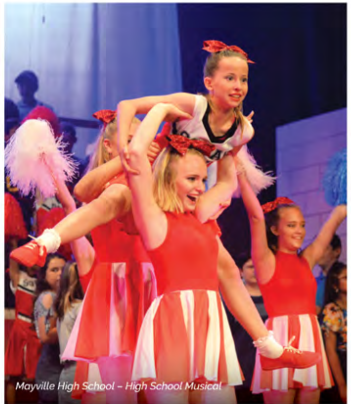
Mayville High School - High School Musical