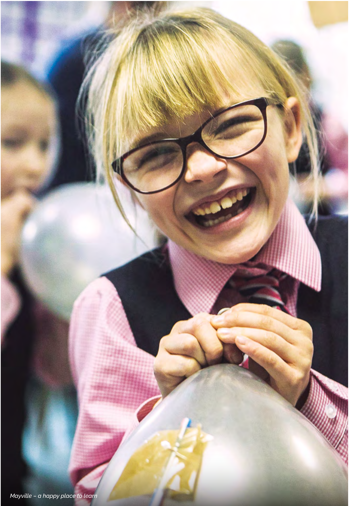
Mayville – a happy place to learn