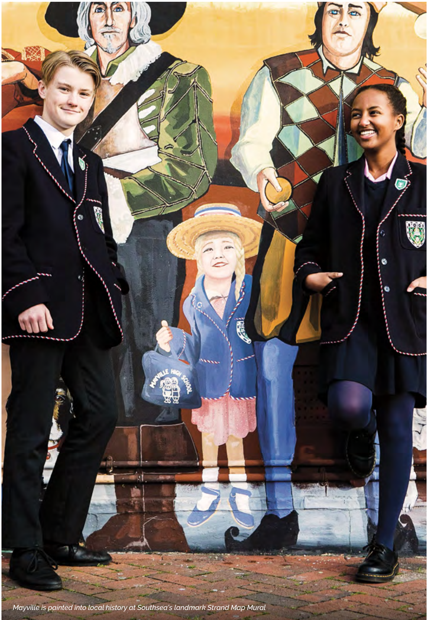
Mayville is painted into local history at Southsea's landmark Strand Map Mural