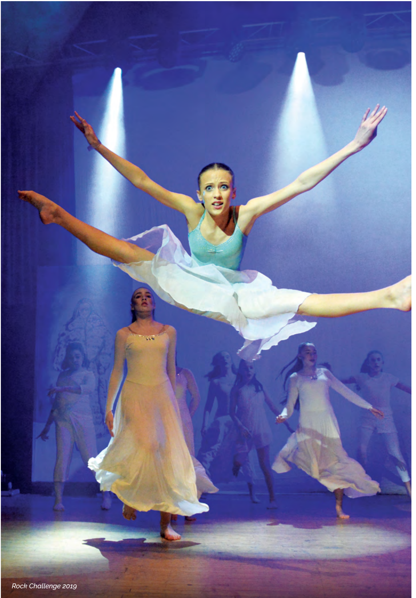
Rock Challenge 2019