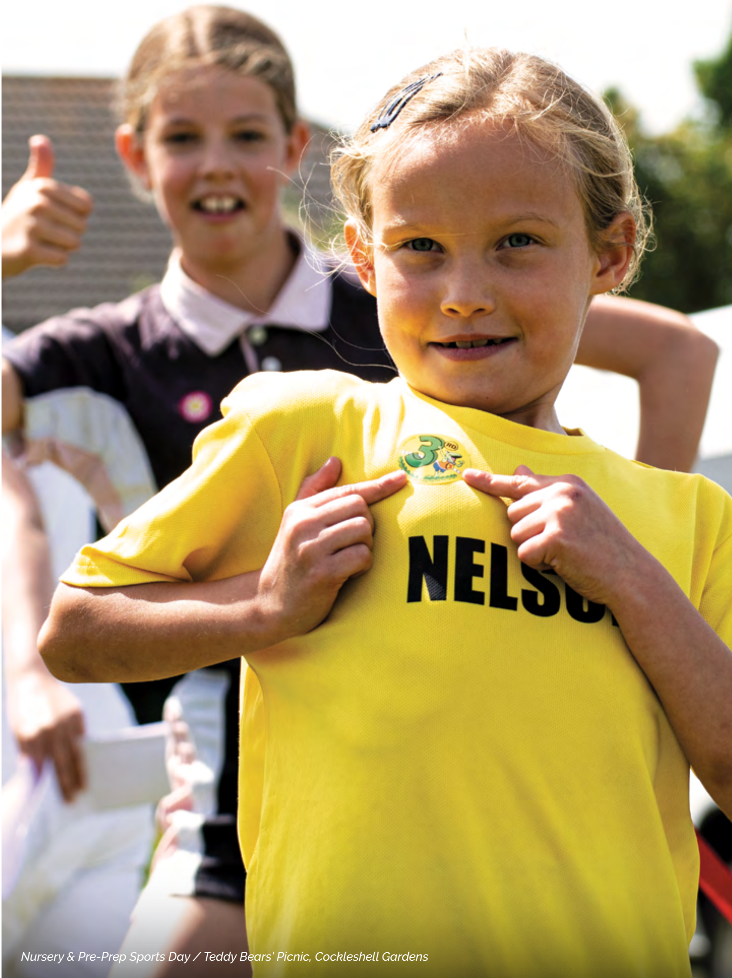
Nursery & Pre-Prep Sports Day / Teddy Bears' Picnic, Cockleshell Gardens