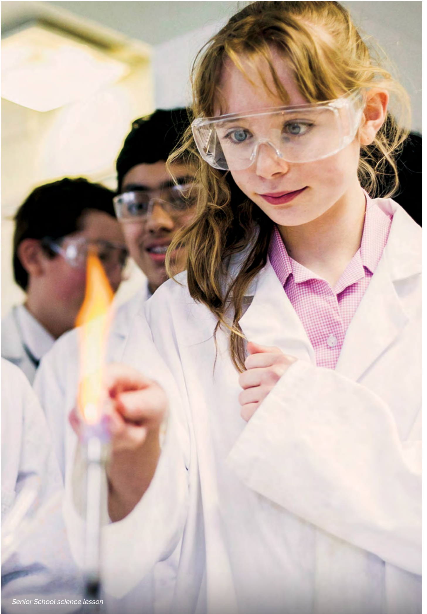
Senior School science lesson