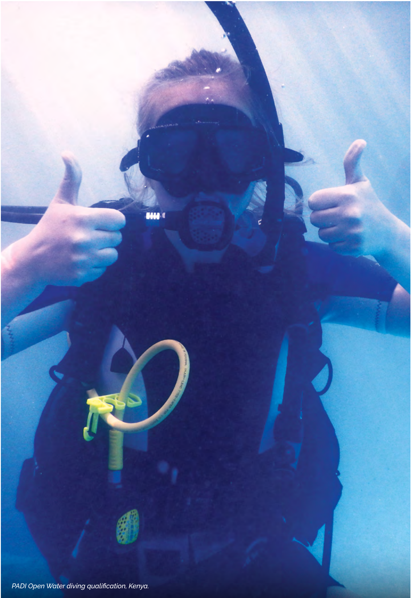
PADI Open Water diving qualification, Kenya.