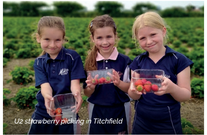
U2 strawberry picking in Titchfield

Day trips to local attractions, such as Fishbourne Roman Palace and Amberley Museum, gave pupils the opportunity to step back in time and experience history.