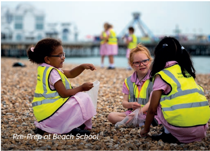
Pre-Prep at Beach School