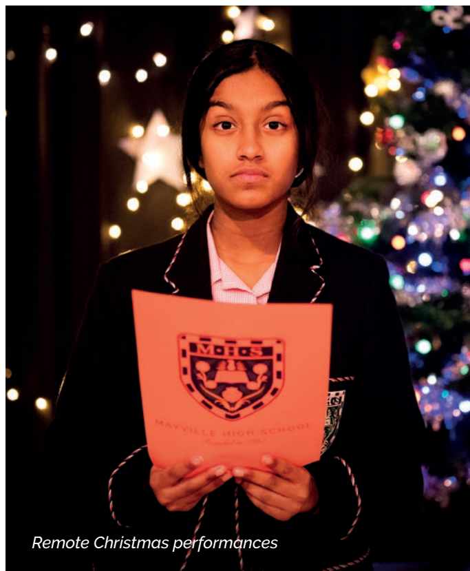
Remote Christmas performances

Throughout the period of remote learning and the return to in-person learning at school, our approach was underpinned by the importance of wellbeing and showing kindness to one another. Junior pupils were encouraged to write about their feelings in Happy Books and could make use of 'chill out' rooms, if they needed a little extra time and space. Pupils nominated one another for Kindness Awards, to recognise and value the small acts of kindness and friendship that might otherwise go unnoticed.