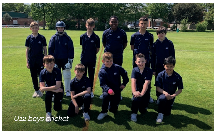
U12 boys cricket

After a year devoid of cricket fixtures, we were pleased for our teams to take to the crease again. Our U13 boys narrowly lost against an U15 side from Boundary Oak. Our U12 side were holding their own against a strong West Hill Park side (that featured four county players) before the great British summer called a draw! Our mixed team won the Pride of the Games trophy at the Portsmouth Schools Mixed Kwik Cricket Tournament , for being the team which best embodied the spirit and values of the competition.