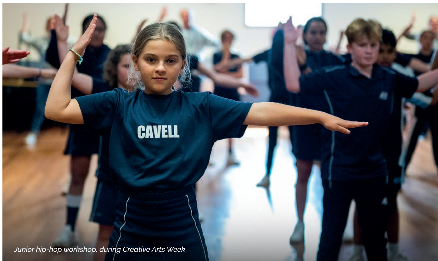
Junior hip-hop workshop, during Creative Arts Week

Remove & U4: 1st: Nelson, 2nd: Cavell, 3rd: Austen. L4 & L5: 1st: Cavell, 2nd: Austen, 3rd: Nelson