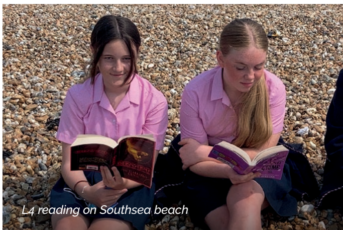
L4 reading on Southsea beach

As well as providing the ideal location for an impromptu reading lesson, Southsea beach provides a great way of engaging pupils with our eco-school commitment. Pupils can see first-hand the impact of plastic waste on both the local environment and the wider ecosystem.