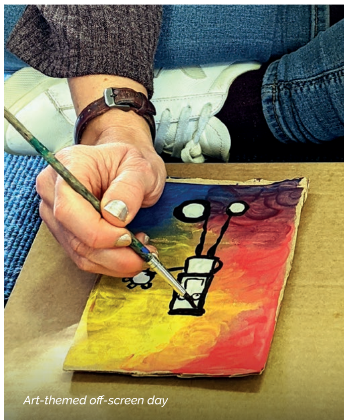
Art-themed off-screen day