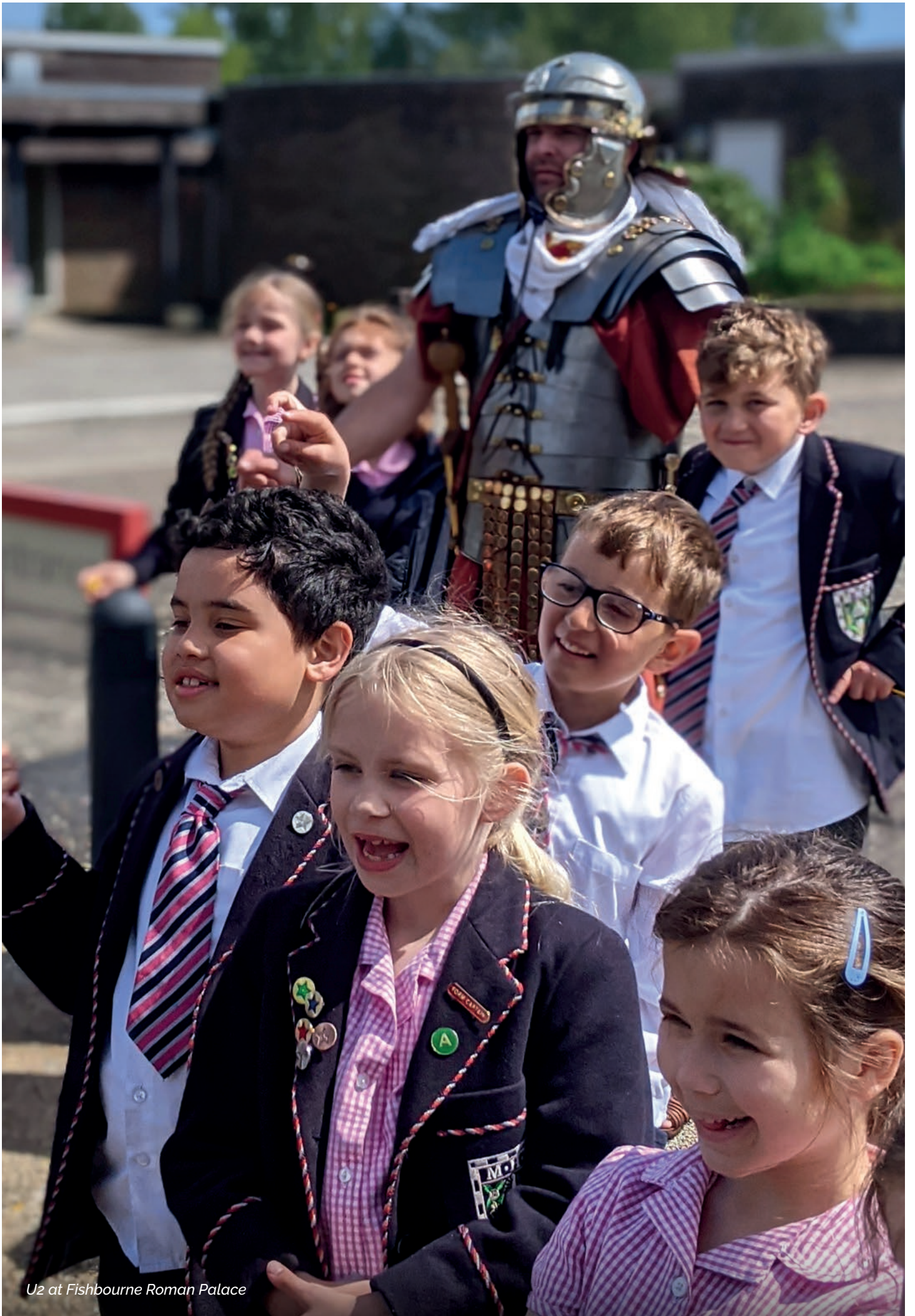
U2 at Fishbourne Roman Palace