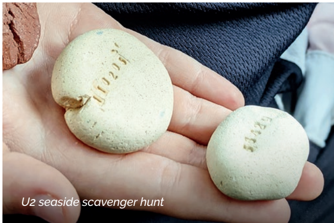
U2 seaside scavenger hunt

Pre-Prep enjoy their regular beachcombing trips and treasure hunts, as part of Beach School .