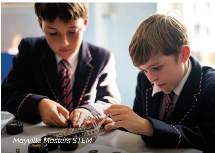
Mayville Masters STEM