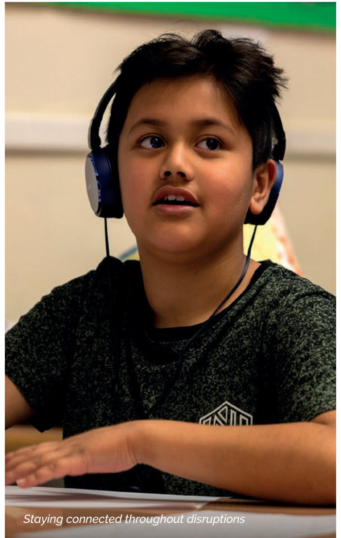
Staying connected throughout disruptions

Parent-teacher communication was essential to maintaining focus, motivation and all-round wellbeing. Support and advice was on-hand for children and parents who struggled with any aspect of remote learning. Ongoing dialogue between teachers, tutors and parents allowed us to adapt the content of online learning, to better suit pupils' needs and help them overcome any difficulties they were experiencing.