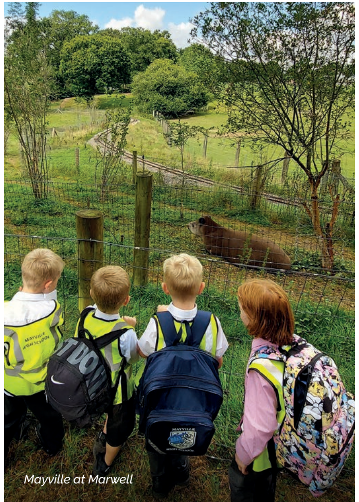
Mayville at Marwell

At Mayville, finding your shine is at the heart of what we do and this is reflected in our motto – 'Quid Facis Bene Face' – what you do, do well.