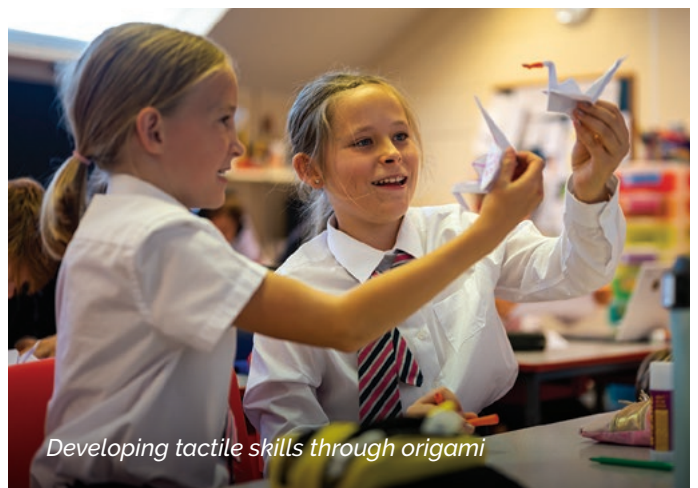
Developing tactile skills through origami