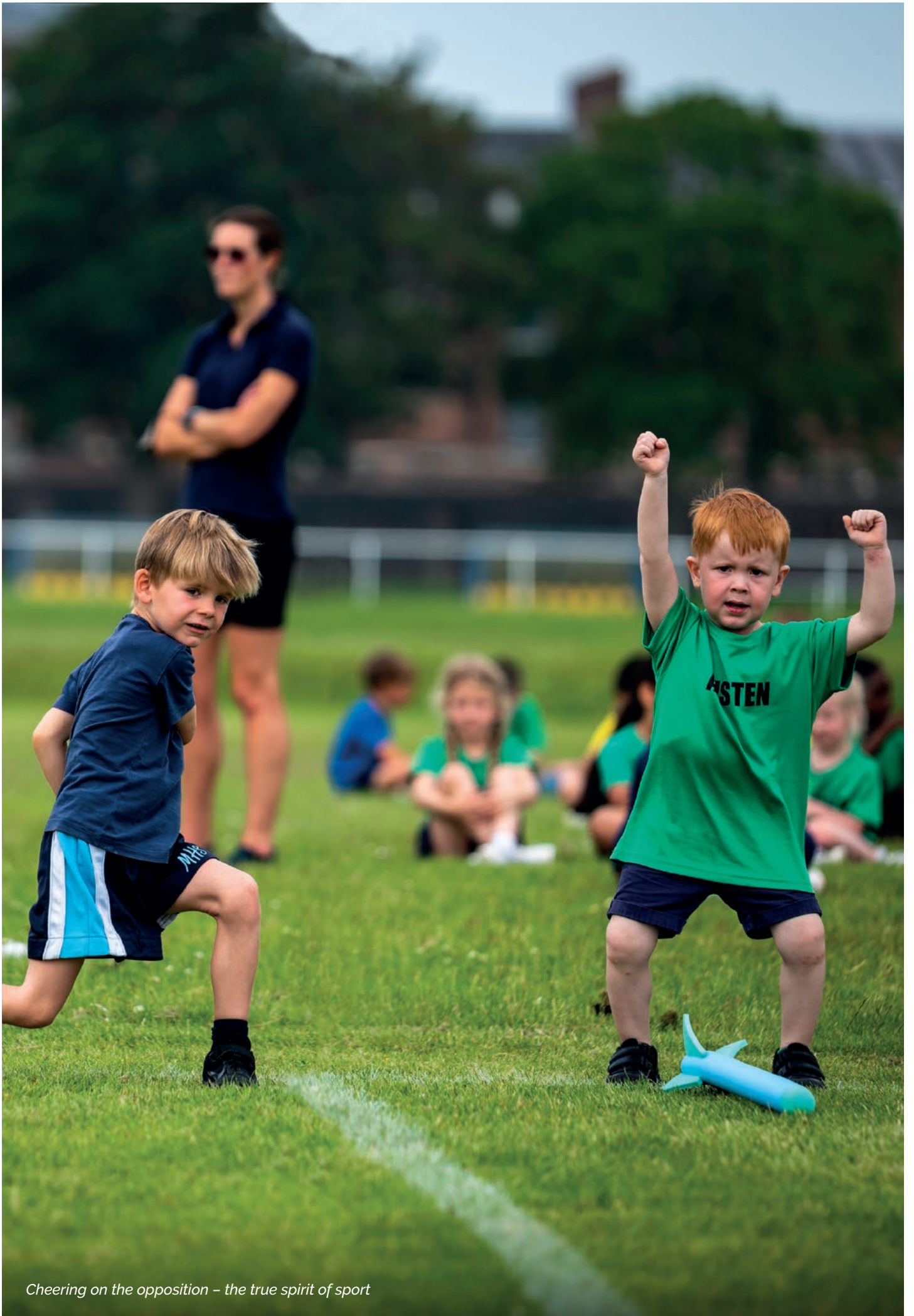
Cheering on the opposition – the true spirit of sport