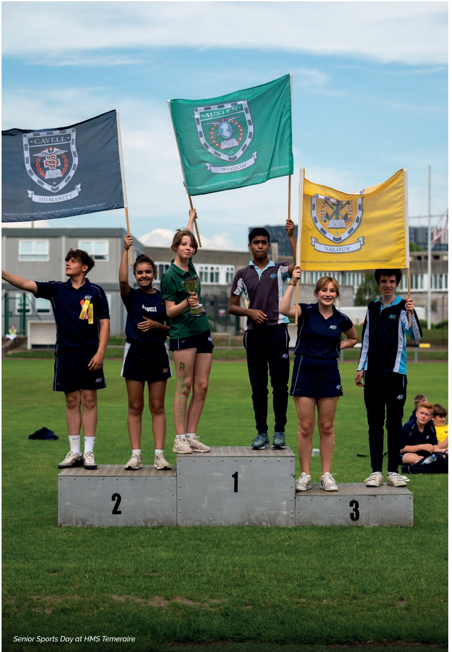
Senior Sports Day at HMS Temeraire