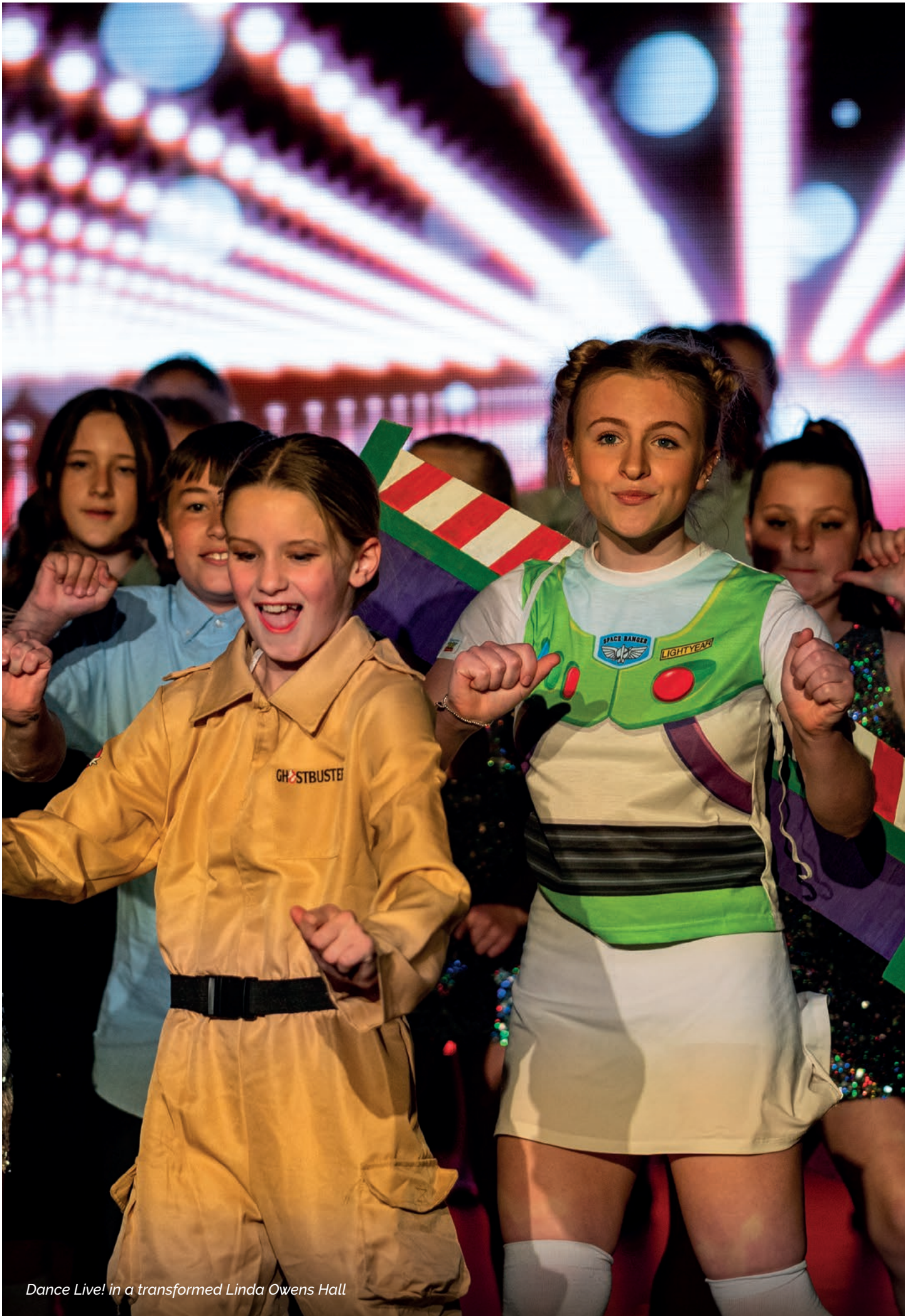
Dance Live! in a transformed Linda Owens Hall