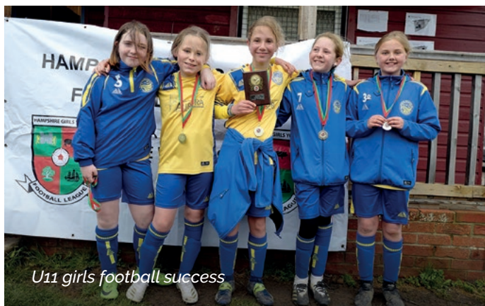
U11 girls football success

Building on last year's successes in girls' football, five of our Year 6 (U3) girls were part of the club side that won the Hampshire Girls Youth Football League U11 Plate . In May, our U9 girls also played their first ever competitive fixture, drawing 1-1. The same age group won their first ever netball match 7-4.