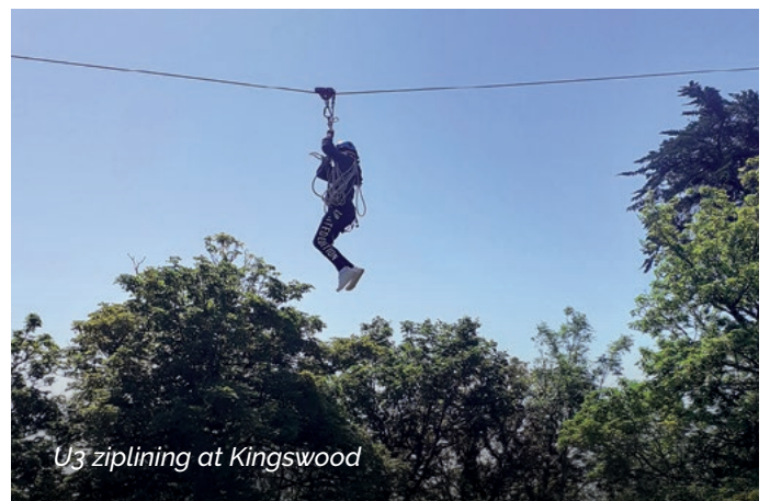
U3 ziplining at Kingswood

Kingswood activity centre on the Isle of Wight is a firm favourite with pupils, offering a range of outdoor activities and problem-solving challenges. U3 enjoyed a weekend residential – abseiling, ziplining and taking the 'leap of faith'. We could not be more pleased to see such trips and residentials back on the school calendar.