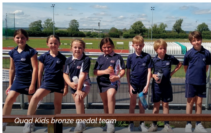
Quad Kids bronze medal team

Our Junior team placed third overall in the Portsmouth Schools Quad Kids Athletics competition, with a number of individual athletes taking podiums in their events.