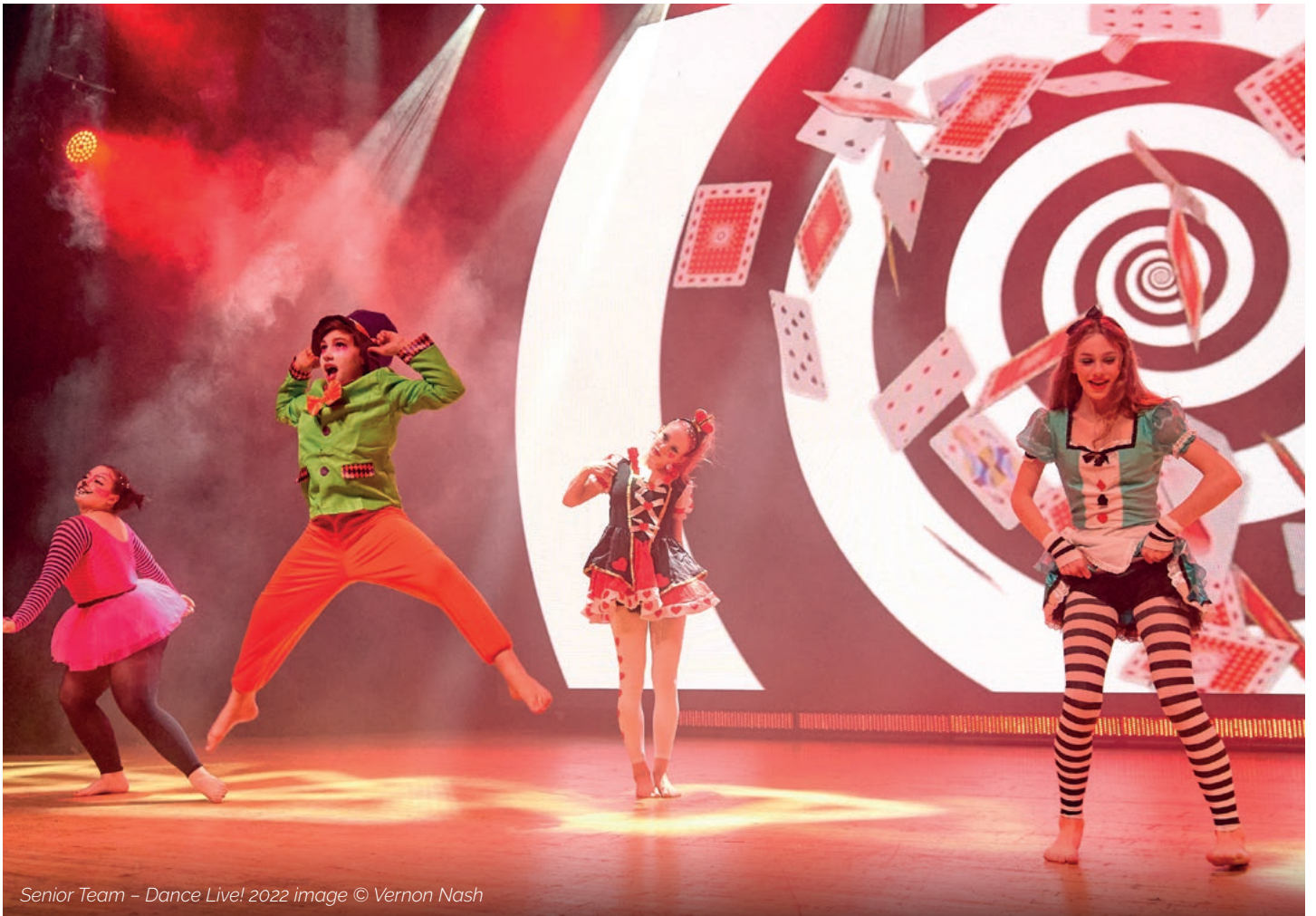
Senior Team – Dance Live! 2022 image © Vernon Nash