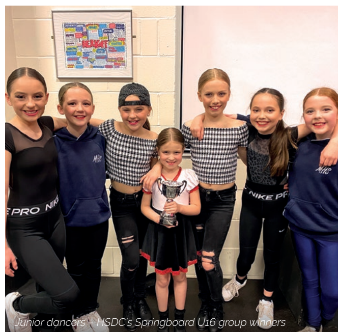
Junior dancers – HSDC's Springboard U16 group winners