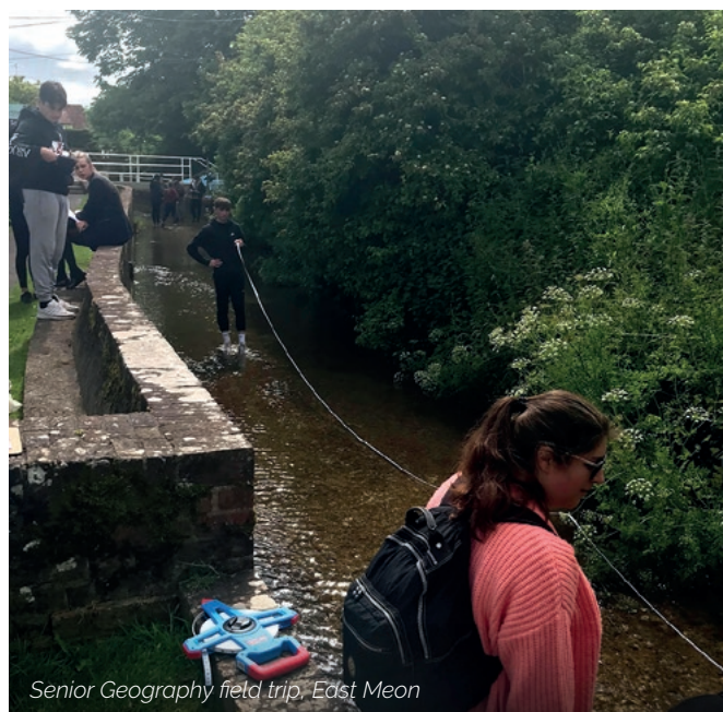
Senior Geography field trip, East Meon