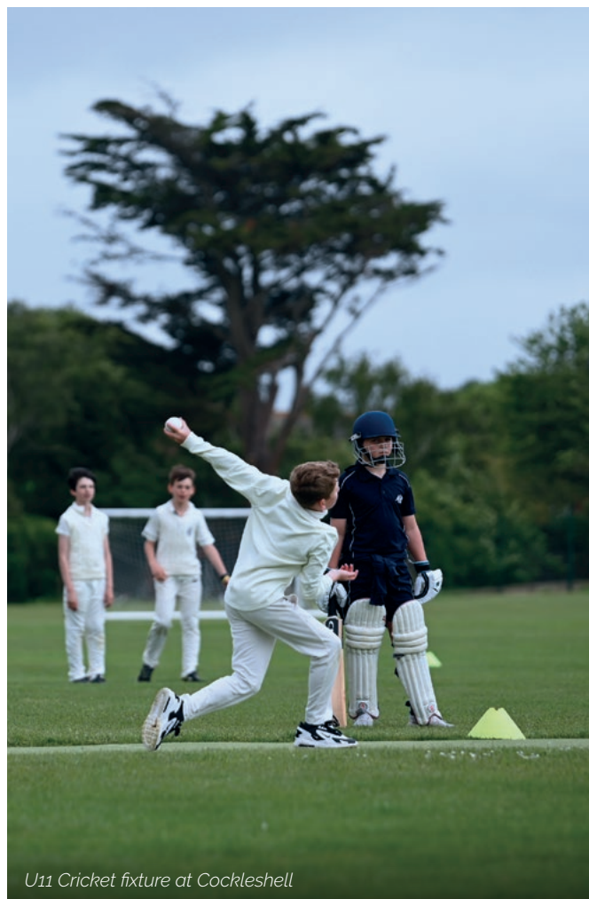
U11 Cricket fixture at Cockleshell