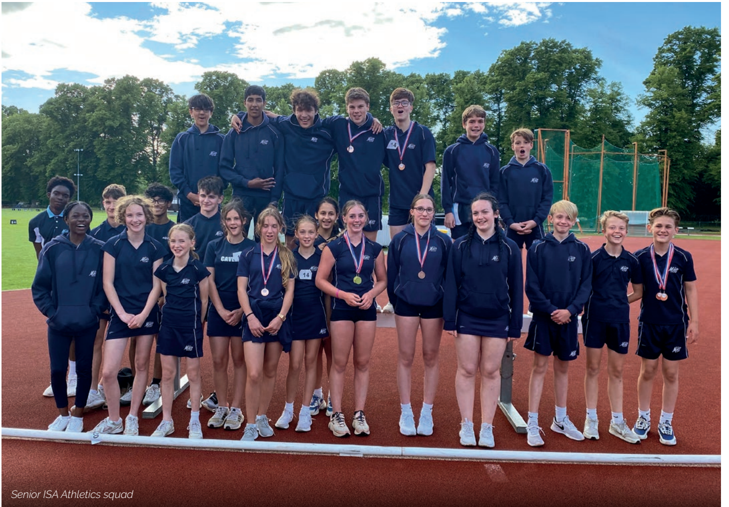
Senior ISA Athletics squad