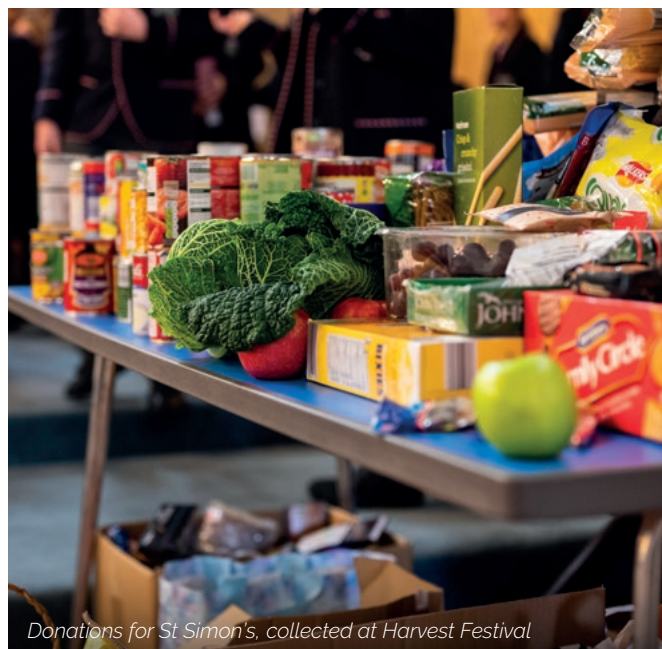
Donations for St Simon's, collected at Harvest Festival

Mayville promotes an ethos of pupils contributing to the wider community, for the benefit of others. Through collecting donations or fundraising for charities, we have supported a number of causes throughout the year. Pupils are also encouraged to use their voice to shape the world of the future.