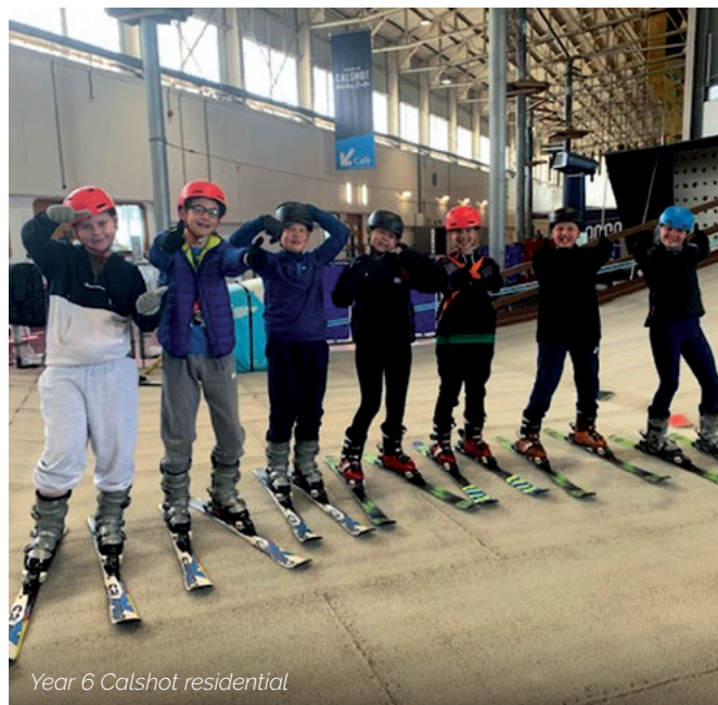
Year 6 Calshot residential