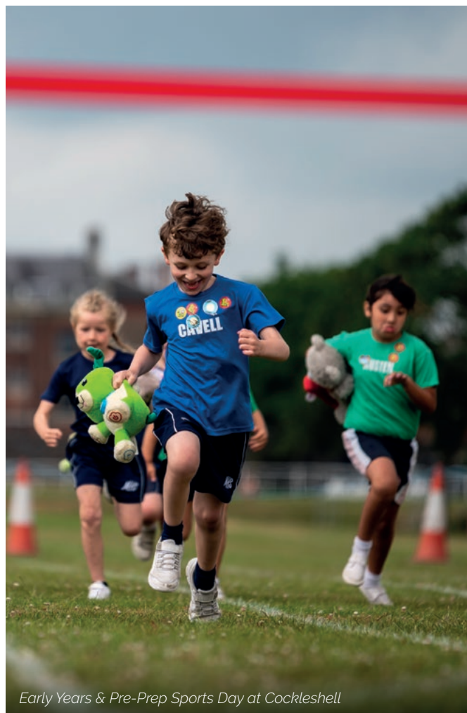
Early Years & Pre-Prep Sports Day at Cockleshell