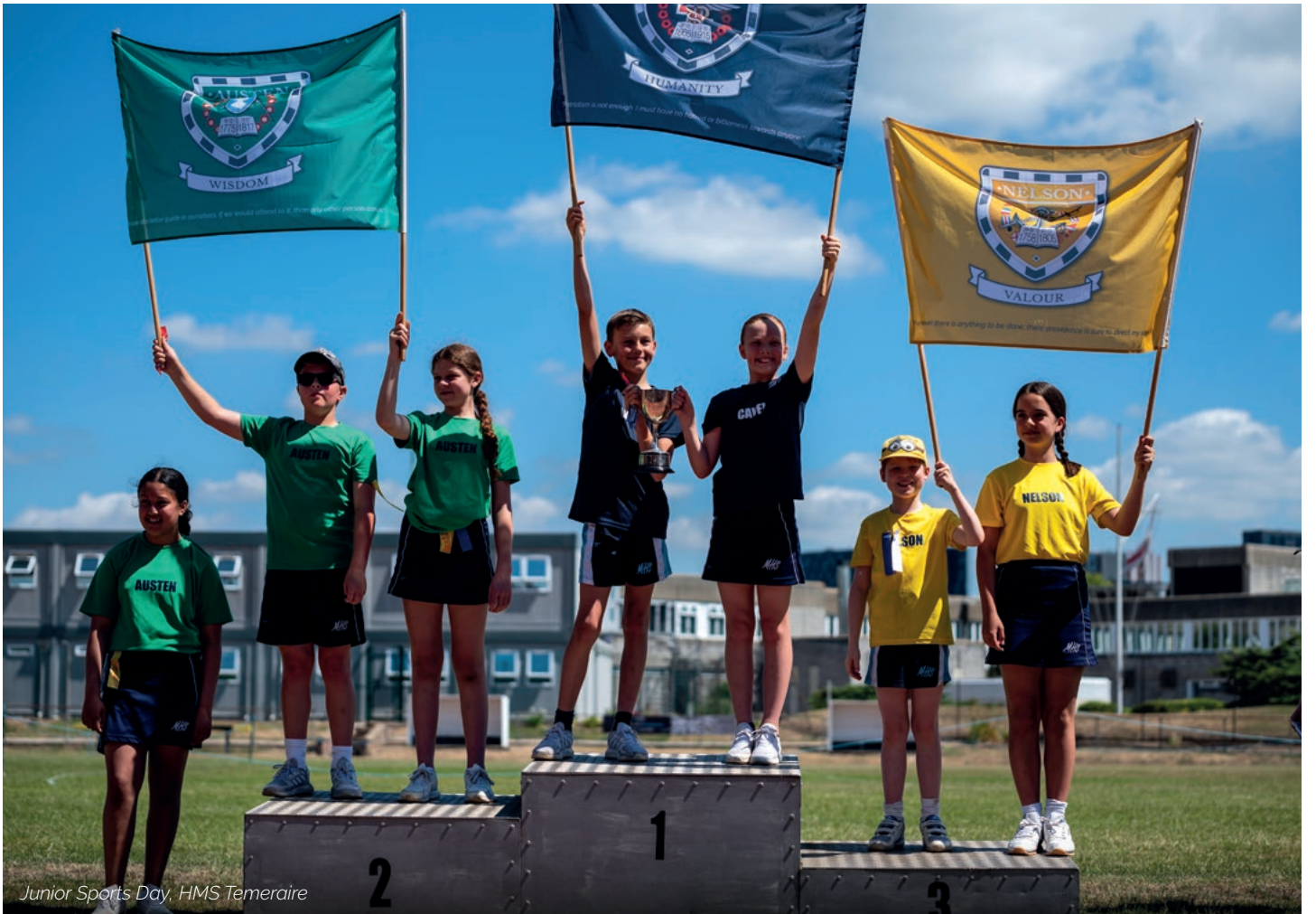
Junior Sports Day, HMS Temeraire