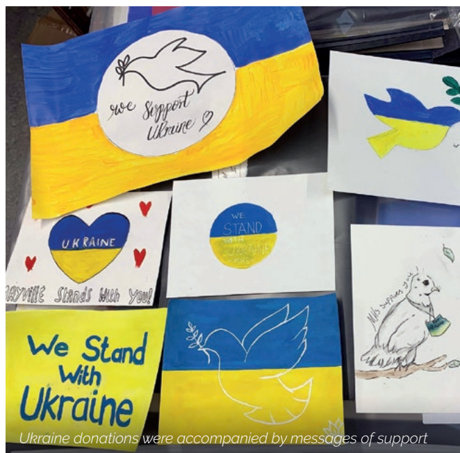
Ukraine donations were accompanied by messages of support

In response to the invasion of Ukraine and seeing the plight of those families who subsequently were forced to leave their homes, we organised a collection of essential items to be taken to the Poland - Ukraine border. We were overwhelmed by the show of support and generosity from our school community, who collected an incredible amount of donations, which were sorted and packaged by pupils, staff and friends of Mayville.