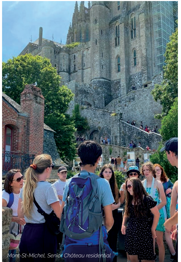
Mont-St-Michel, Senior Château residential