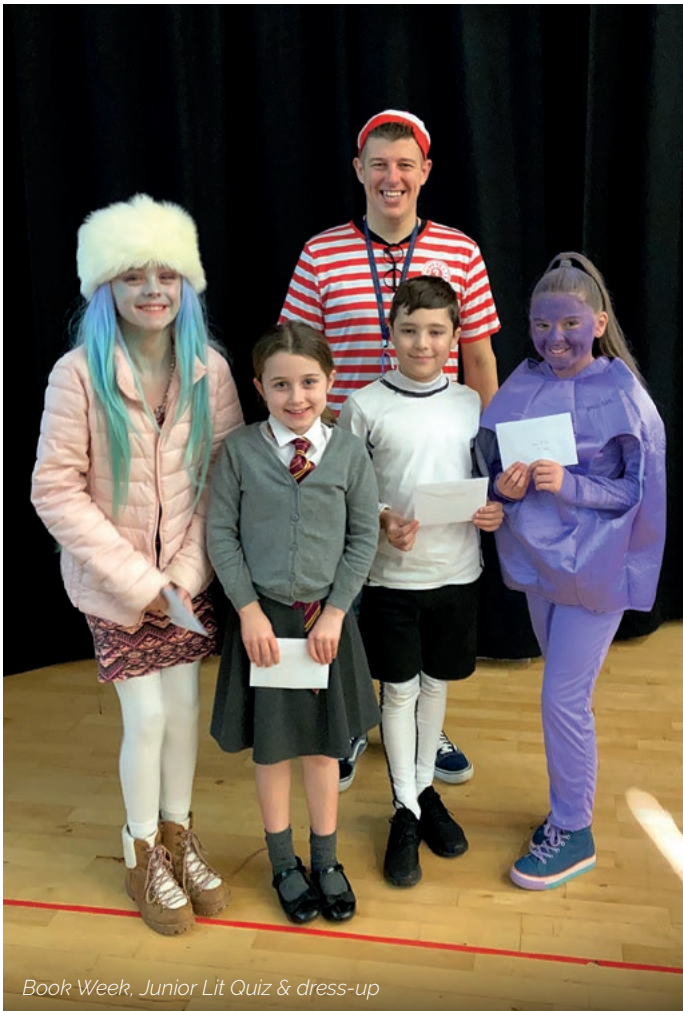
Book Week, Junior Lit Quiz & dress-up