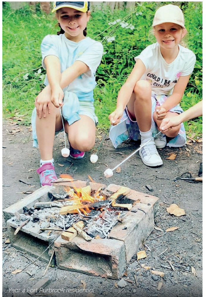
Year 4 Fort Purbrook residential