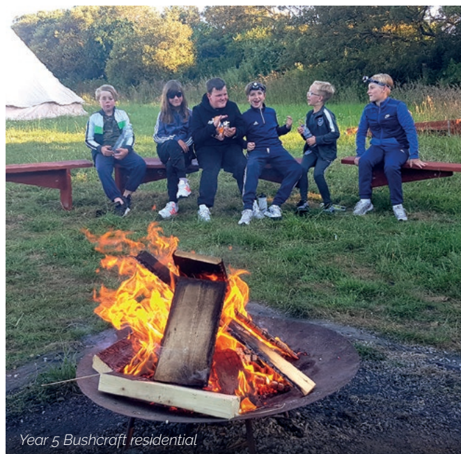
Year 5 Bushcraft residential

Closer to home, day visits and field trips enhanced pupils' studies in History, Geography and topic work. In a new Junior School trip, pupils from Years 3 & 4 (U2 & L3) visited Little Woodham, to learn about life in the 17th century, meeting potters, turners, musketeers and surgeons along the way. Year 3 (U2) also met a former Mayville teacher running workshops, whilst visiting Fishbourne Roman Palace!