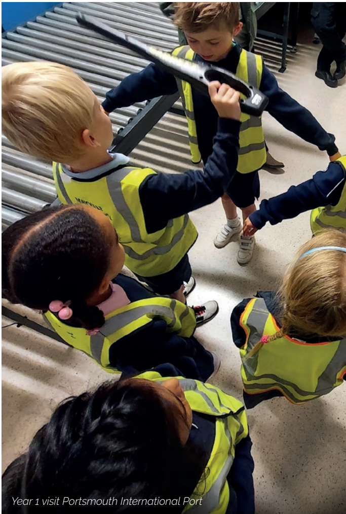
Year 1 visit Portsmouth International Port