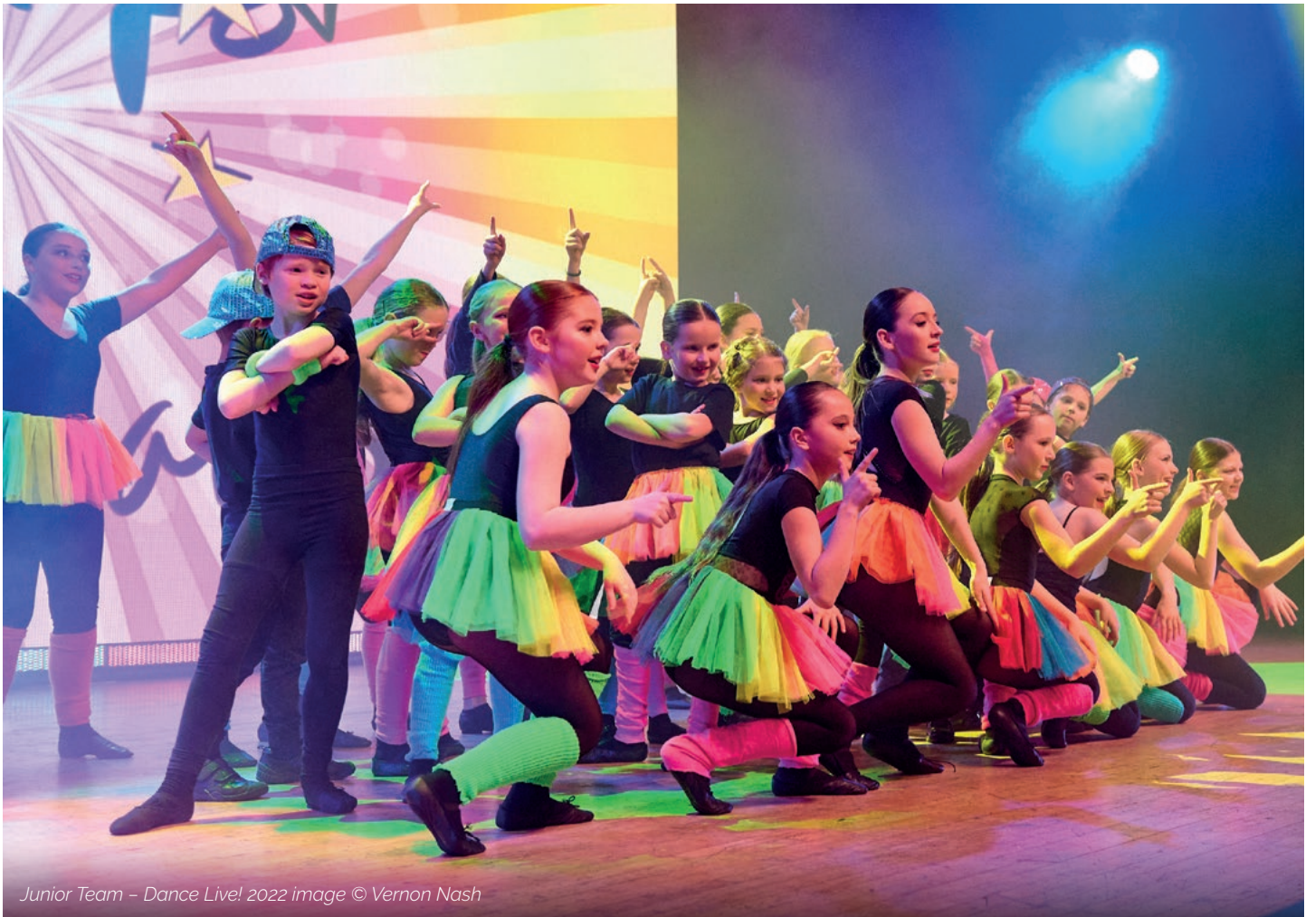
Junior Team – Dance Live! 2022