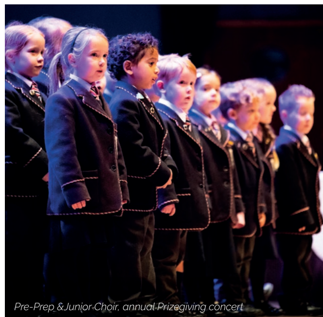
Pre-Prep & Junior Choir, annual Prizegiving concert