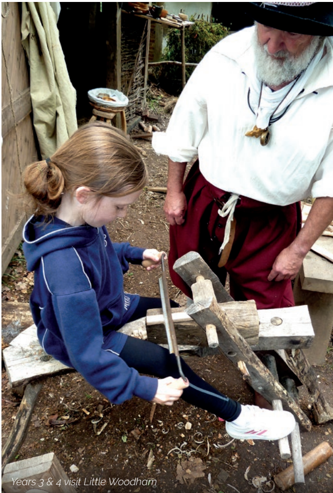
Years 3 & 4 visit Little Woodham