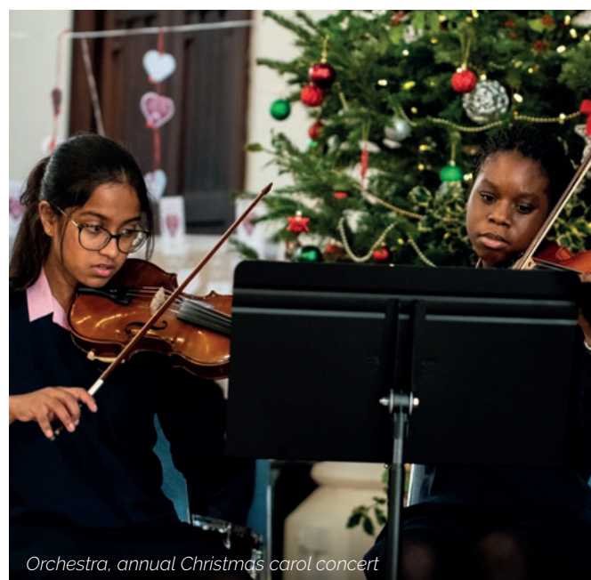
Orchestra, annual Christmas carol concert

In March, we took 19 senior dancers and seven junior dancers to HSDC's Springboard Dance Competition. We had a solo, a duet and two groups in the U16 section, whilst our Year 11 (U5) girls went into a tough Over 16 group section. Despite competing against much older dancers, our Junior group and duet both took first place in the U16 competition, bringing home two trophies.